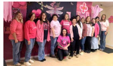
Clinch Valley Health mammography technicians raised awareness of breast health by delivering pink donuts and annual screening education to local organizations.