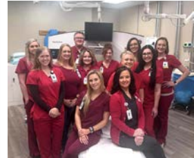
Clinch Valley Health team members participated in National Wear Red Day to raise awareness about women's heart health.

Lifepoint Health National Quality Leader designation recognizes hospitals that have excelled in leadership, performance improvement, culture and patient and family engagement, and have the capacity to continuously measure and improve what they do.