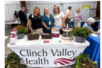
Clinch Valley employees enjoyed participating in Senior Day at the Tazewell County Fair.