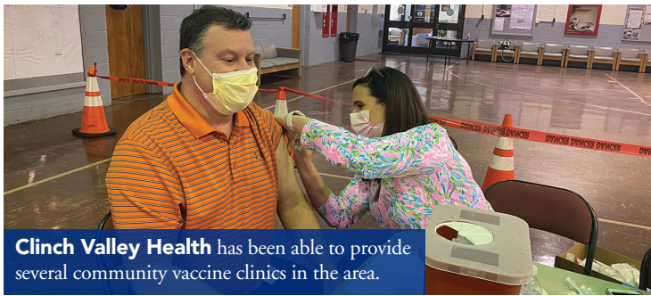
Clinch Valley Health has been able to provide several community vaccine clinics in the area.